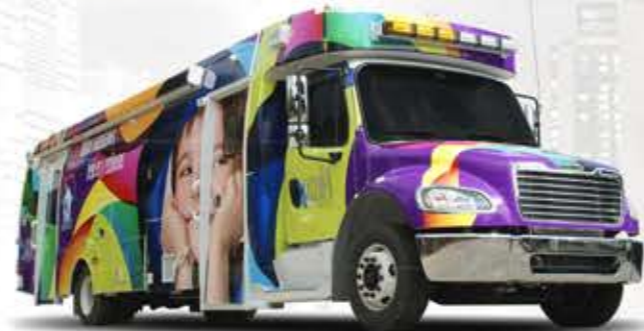
Medical Wellness Clinic