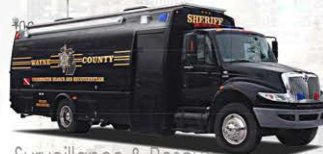
Surveillance & Rescue