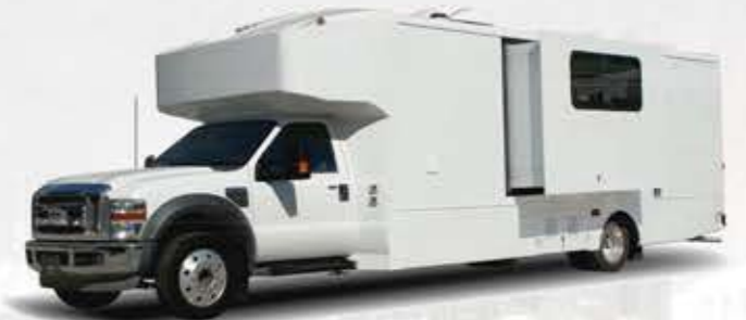
Interview / Counseling (with slide-out)